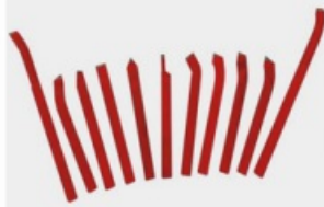
Cutter 11 pieces set