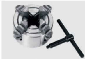
4-jaw chuck (independent)with flange